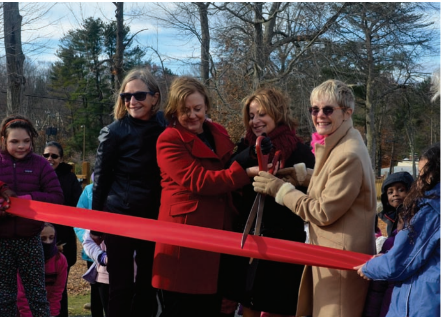
The Natural Playground Ribbon Cutting Ceremony, November 14, 2018